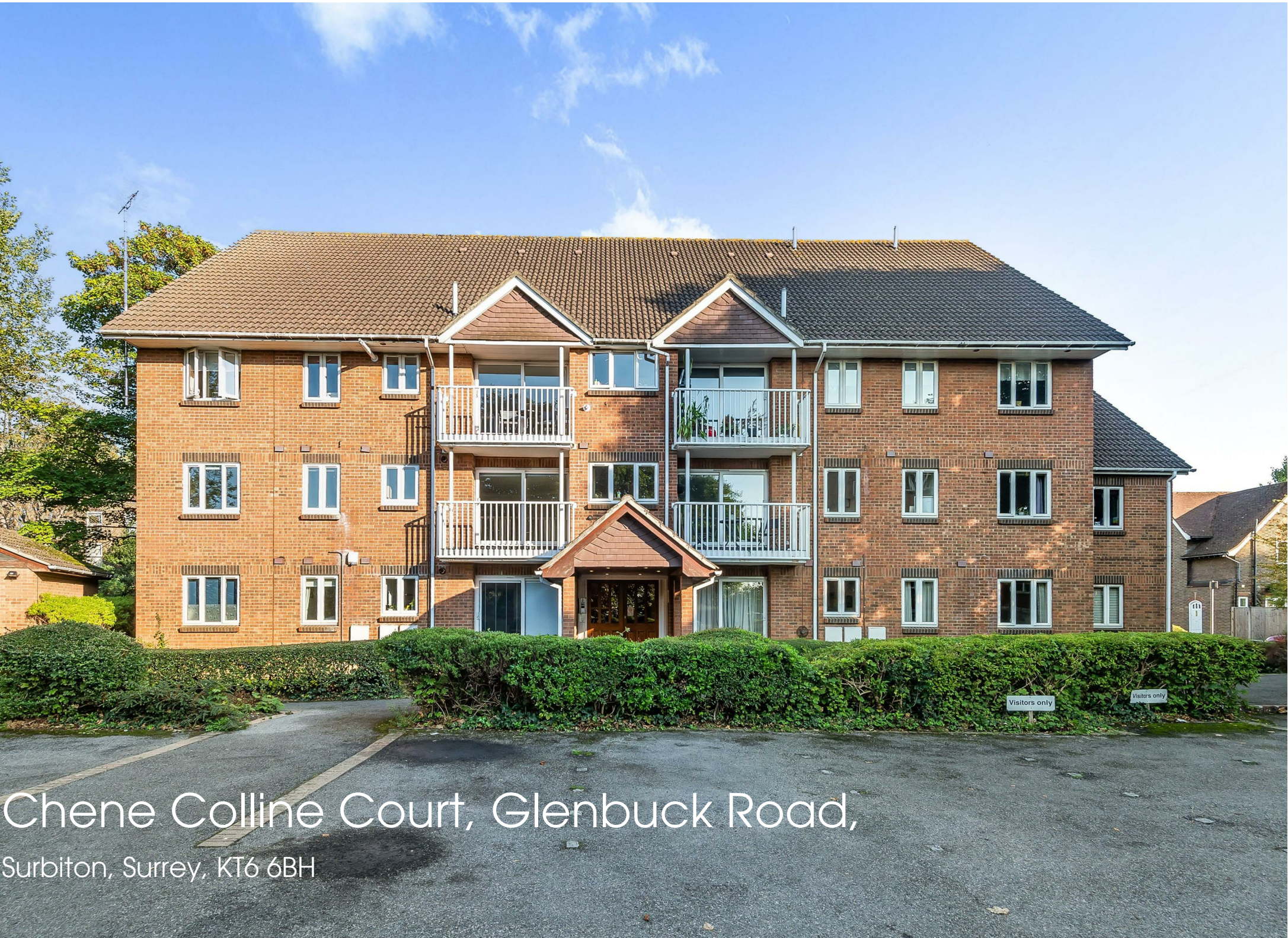
Chene Colline Court, Glenbuck Road, Surbiton, Surrey, KT6 6BH